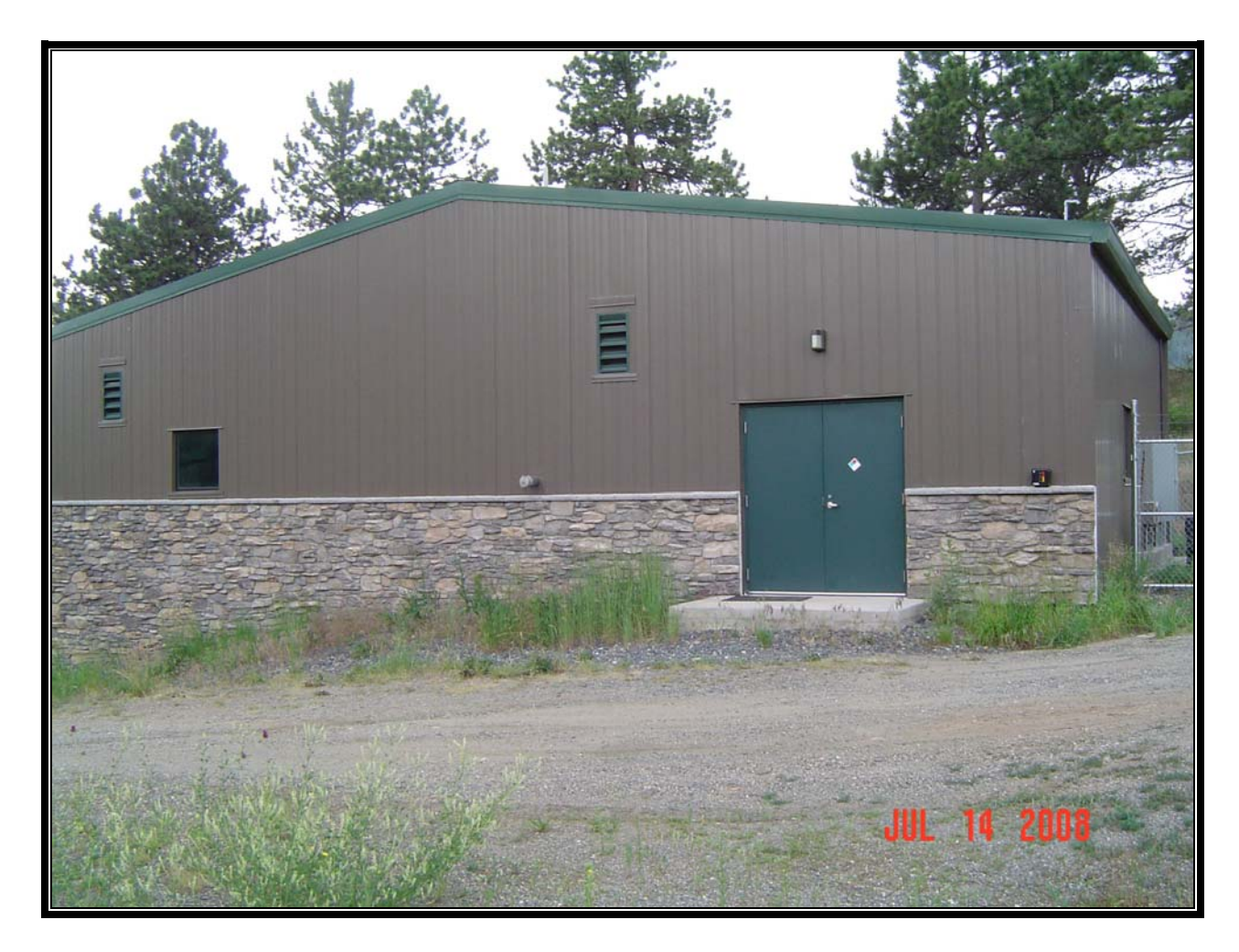
Figure 1. Treatment Facility Exterior