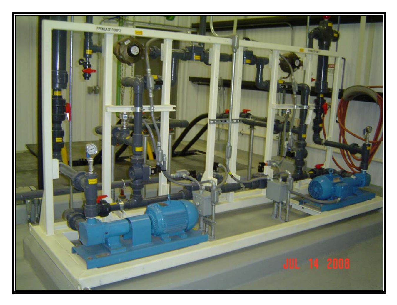
Figure 4. Permeate Pumps