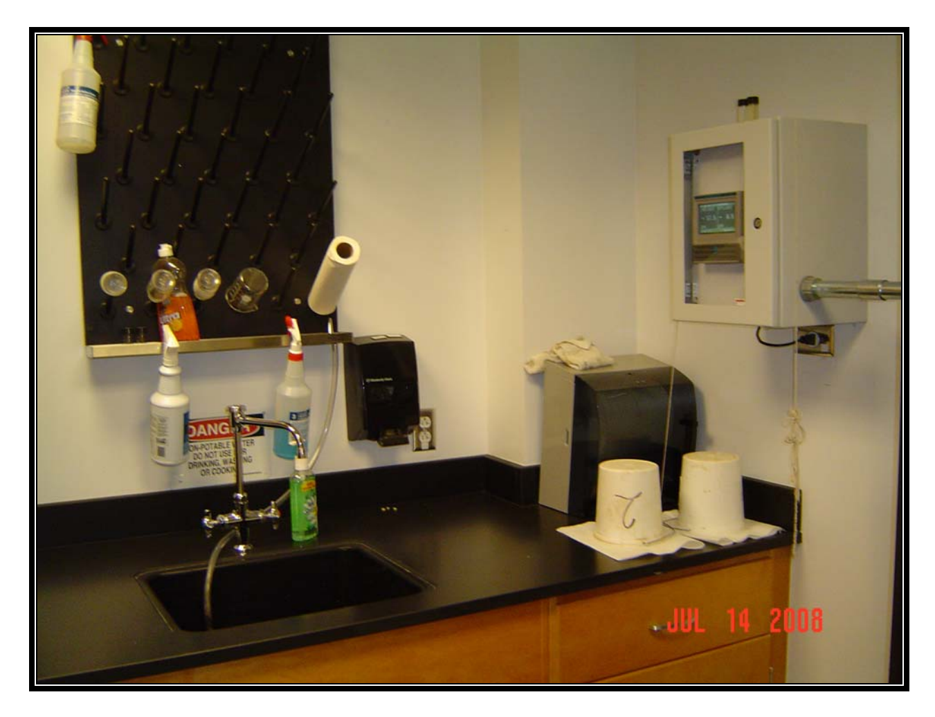
Figure 5. Laboratory