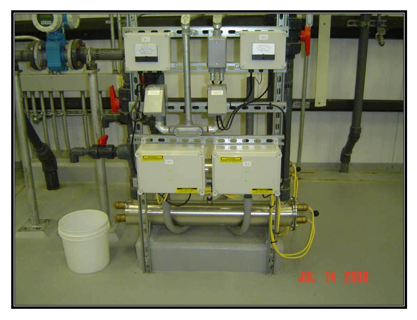
Figure 3. Ultraviolet Disinfection Equipment